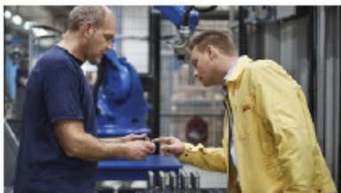
Sandvik Machining Solutions

A leading developer, manufacturer and supplier of advanced stainless steels and special alloys for the most demanding industries.