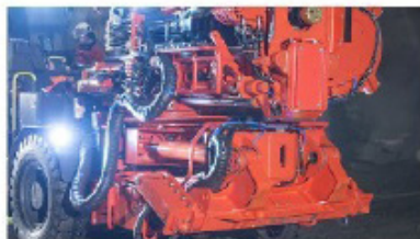
Sandvik Mining and Rock Technology