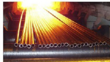
Sandvik Materials Technology

The Sandvik Australia Group is a major supplier of equipment and tools, service, digital solutions and sustainability-driving technologies for the mining and infrastructure industries throughout the region. Our products and services are used in surface and underground mining, bulk materials handling and transportation, as well as exploration. We are one of the largest suppliers of mining equipment.